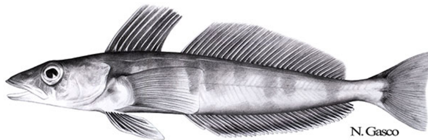
Mackerel icefish, Champsocephalus gunnari Lönnberg, 1905.