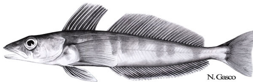
Mackerel icefish, Champscephalus gunnari Lönnberg, 1905.