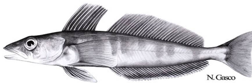
Mackerel icefish, Champsocephalus gunnari Lönnberg, 1905.